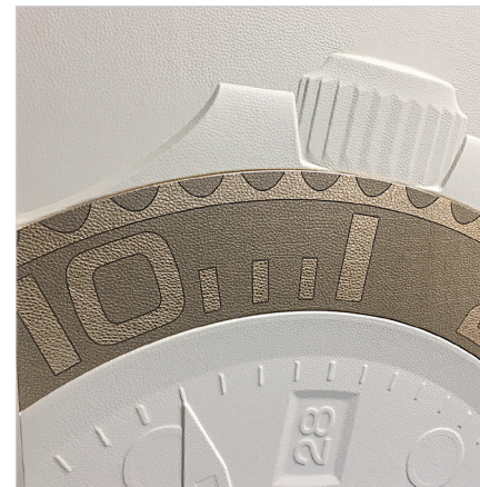
Thermoformed sheet of a display panel.

Leboeuf was immediately convinced by ALWA POR , with which outstanding surface qualities can be realized.